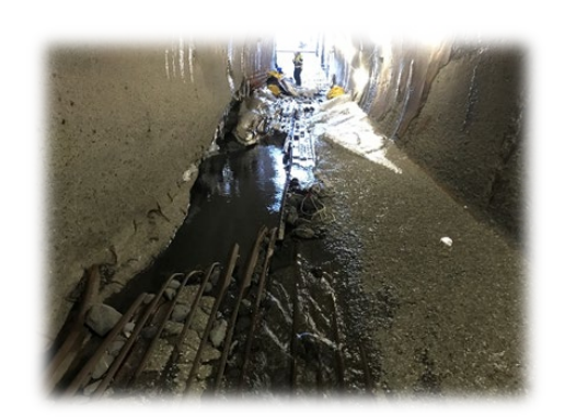
Lowell Creek Diversion IIJA $185M