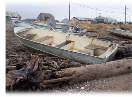
Elim Harbor Improvements IIJA $3.3M (PED only)