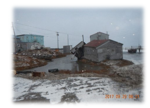
Barrow Coastal Erosion DRSAA $364M