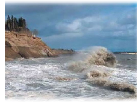
Kenai Bluffs IIJA $28M